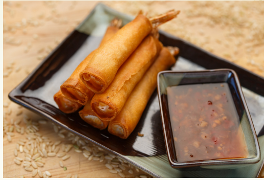
CRISPY SHRIMP ROLLS