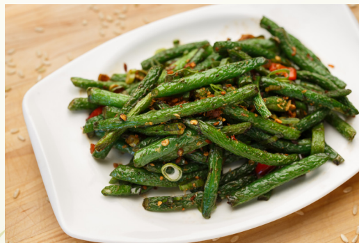
STIR FRIED GREEN BEANS