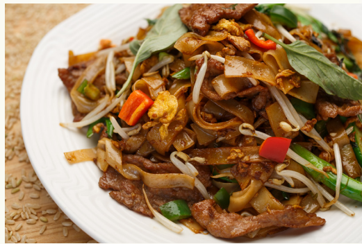
PAD SEE EW