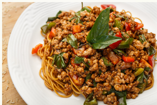
THAI BASIL SPAGHETTI