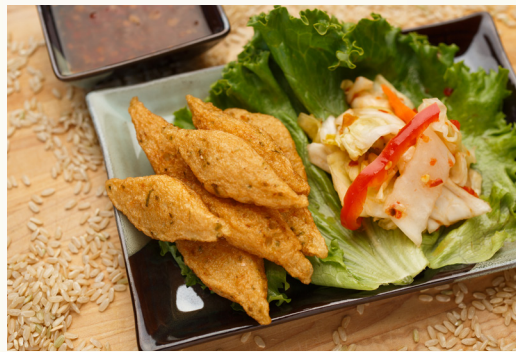
FRIED FISH CAKES