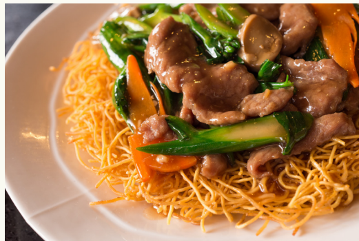
HONG KONG STYLE BEEF CHOW MEIN