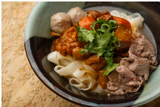
TRIO OF BEEF