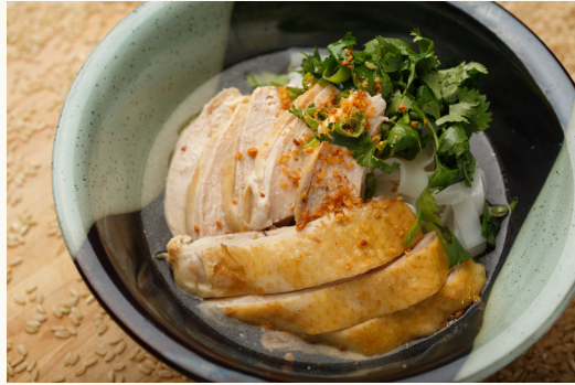
HAINAN CHICKEN BOWL