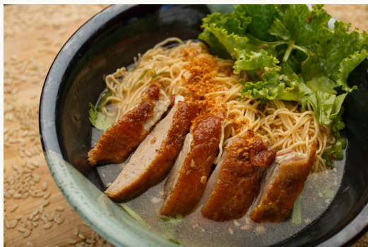
CANTON STYLE ROAST DUCK