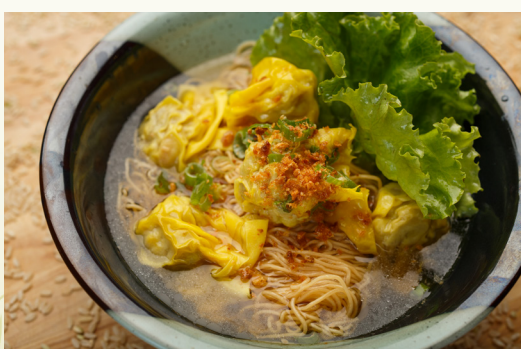
WONTON EGG NOODLE