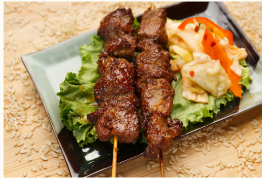
GRILLED BEEF SKEWERS