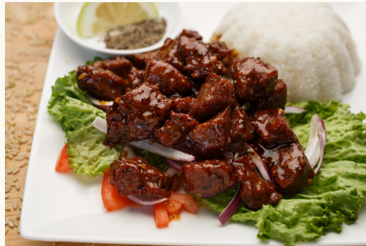
CAPITAL'S FILET MIGNON CUBES