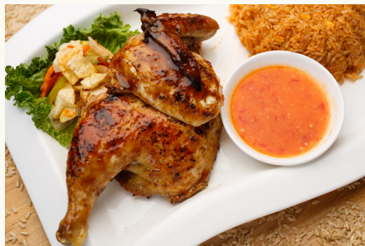
LEMONGRASS ROASTED CHICKEN