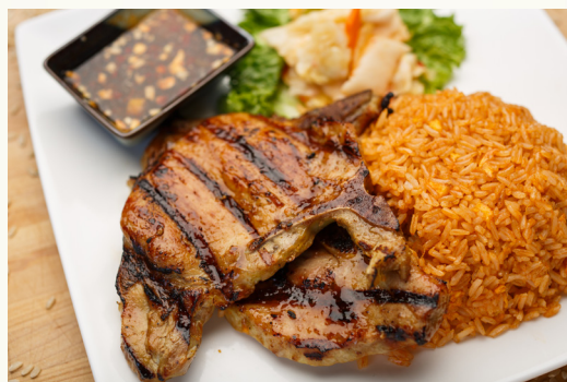
GRILLED PORK CHOP