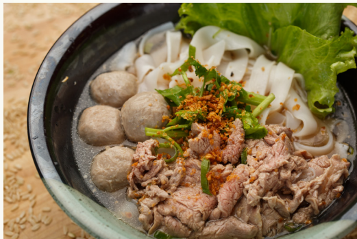
DUO OF BEEF