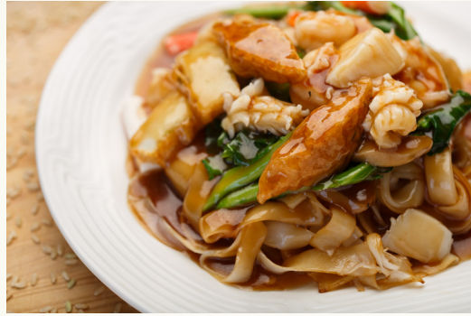
HONG KONG STYLE SEAFOOD CHOW FUN